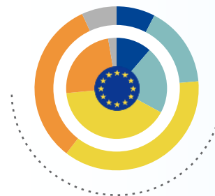
Netherlands (outer circle)

q1 In general, do you agree or disagree that regions, cities and villages have enough influence on the future of the European Union? (%)