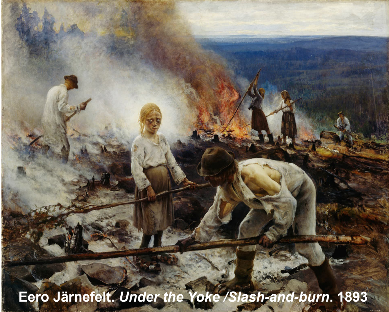
Eero Järnefelt. Under the Yoke /Slash-and-burn . 1893