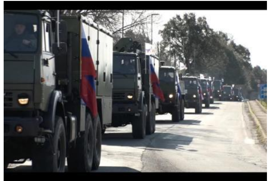
Russian expedition to Bergamo