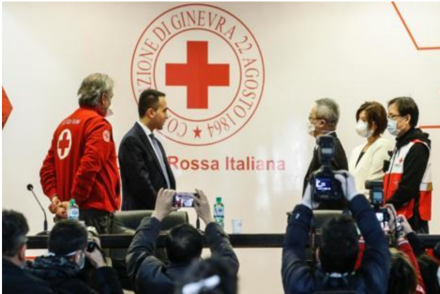
Arrival of protective equipment from China