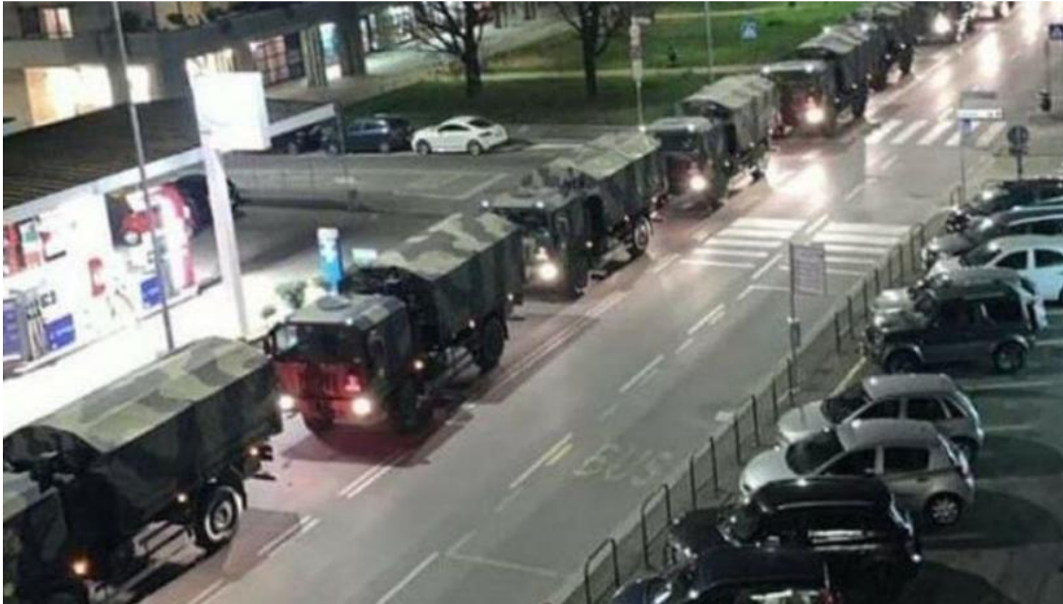
Bergamo, 18 th March 2020