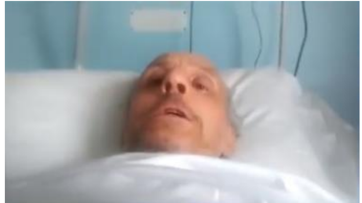
An Italian patient treated in Germany