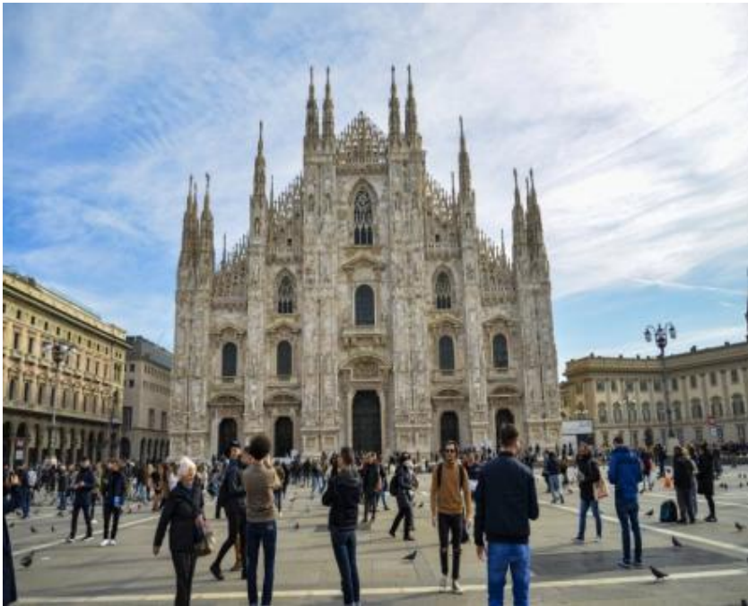
Piazza Duomo, Milan 20 th February 2020