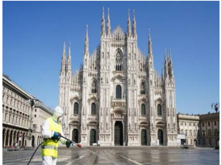
Piazza Duomo, Milan 27 th February 2020