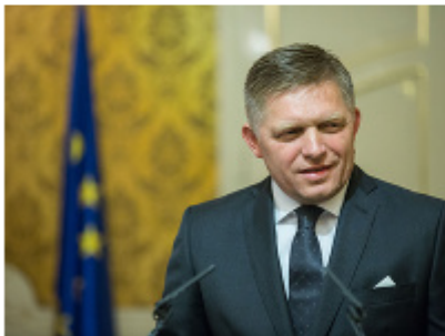
Predseda vlády SR Robert Fico