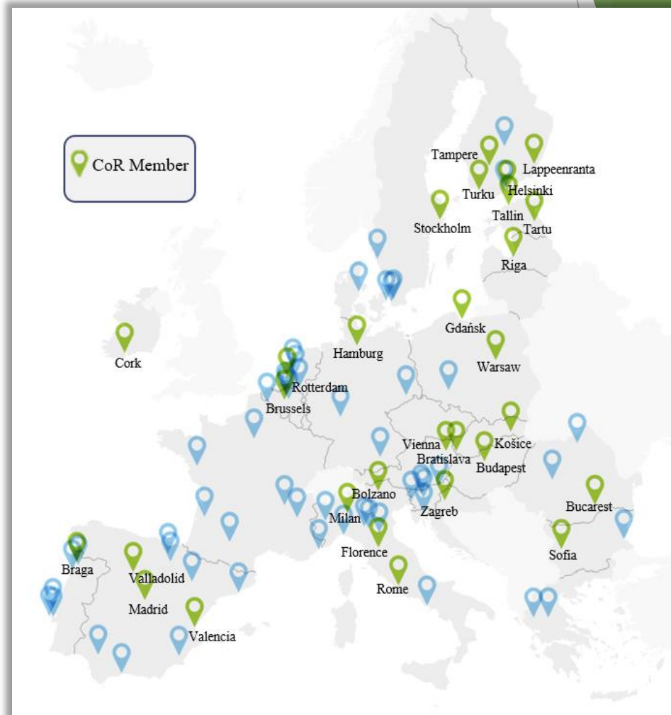
Geographical distribution of LRAs participating in more than 5 initiatives