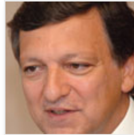
José Manuel Barroso President of the European Commission

" C ities and regions are the first to be able to boost the economy and businesses, and are best placed to guarantee social cohesion and bring citizens on board the European political project. This means that Europe cannot impose itself on its citizens but should build itself through them and in the areas where they live and work."