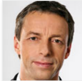
Pavel Bém, Mayor of Prague