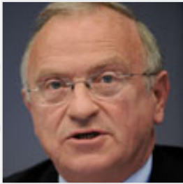
Luc Van den Brande, President of the Committee of the Regions