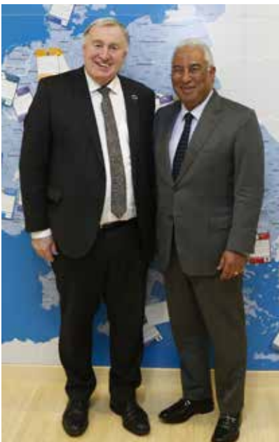
With Portugal's Prime Minister António Costa, 2018