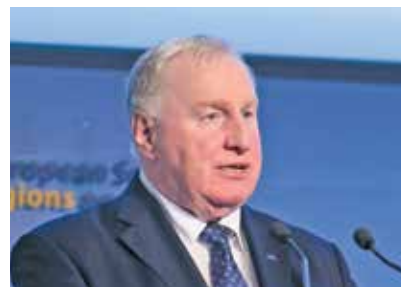
Karl-Heinz Lambertz President