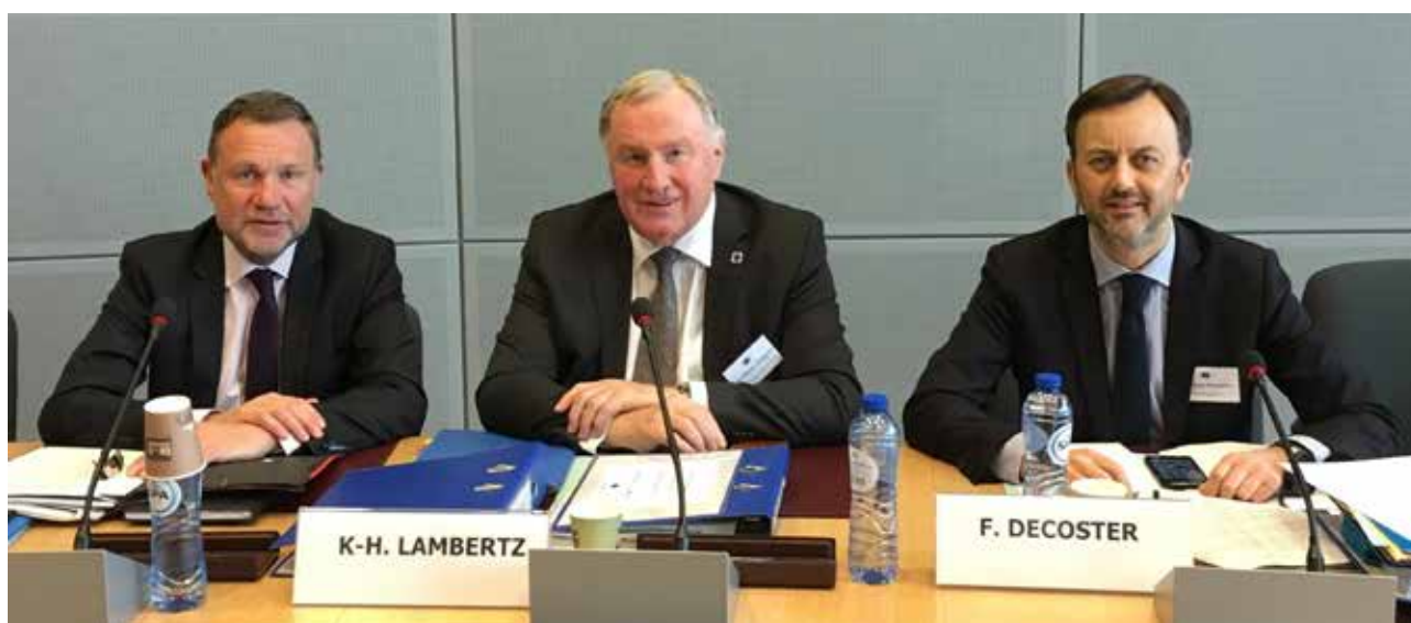
CoR members of the Task Force on Subsidiarity and Proportionality and ‘Doing Less More Efficiently’, 2018

Without Europe’s regions and cities, any effort to produce legislation that brings real benefits to the people cannot be complete. The need for a renewed bottom-up approach to European decision-making has been a priority of the Task Force on Subsidiarity, Proportionality and “Doing Less More Efficiently” and was confirmed in the Commission Communication on The Principles of subsidiarity and proportionality: Strengthening their role in EU policymaking. Its value has been recognised by institutional, national and subnational actors across Europe.