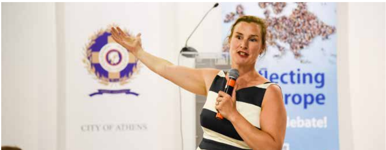
European Committee of the Regions Citizens' Dialogue in Athens

The final report accompanied the Opinion Reflecting on Europe: the voice of local and regional authorities to rebuild trust in the European Union (2018).