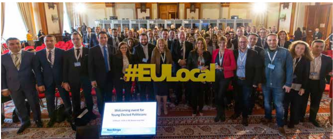
8 th European Summit of Regions and Cities in Bucharest, March 2019

The EU needs its cities and regions as much as they need the EU. Regions and cities are not just the building blocks of each individual Member State, they are the building blocks of the EU itself. The 8th Summit of Regions and Cities in March 2019 set out a 10-point declaration for the future of the EU based on building the EU from the ground up (see Annex). With regions and cities, the European Committee of the Regions aims to strengthen the local dimension of EU politics.