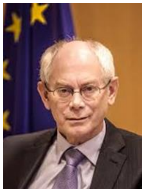
Herman Van Rompuy – Chair