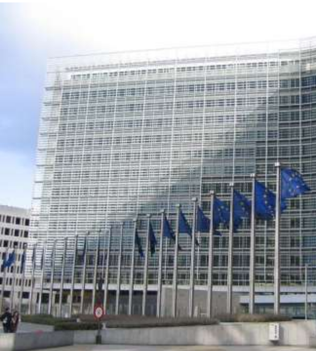
Lobbying for cultural heritage