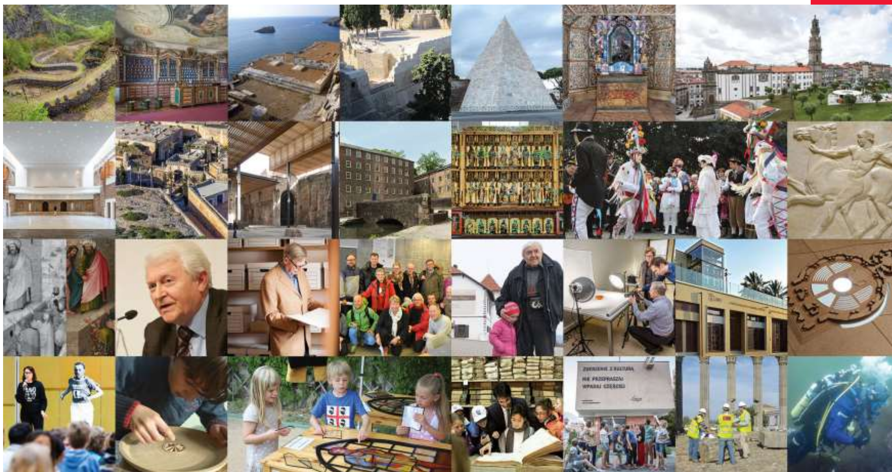
Above: the 2017 laureates – 31 projects from 20 European countries