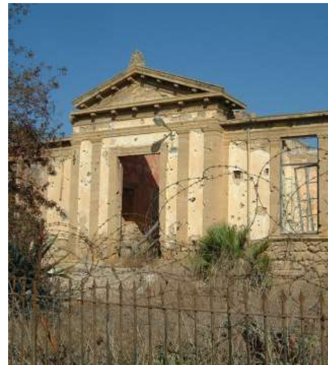
Campaigning to save endangered heritage