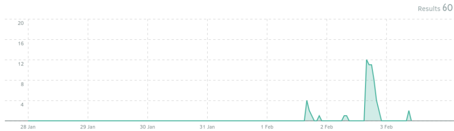
#EULocal hashtag mentions over time